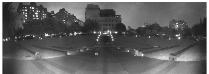
Panoramic IR Illumination