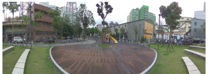
8MP Panoramic View