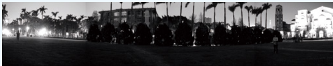
Night View (IR Off)