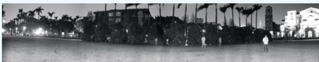
Night View (IR On)