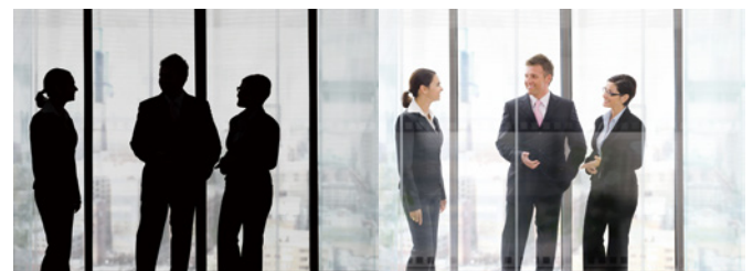
Without WDR Pro