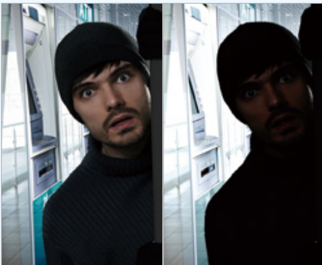
With WDR Pro