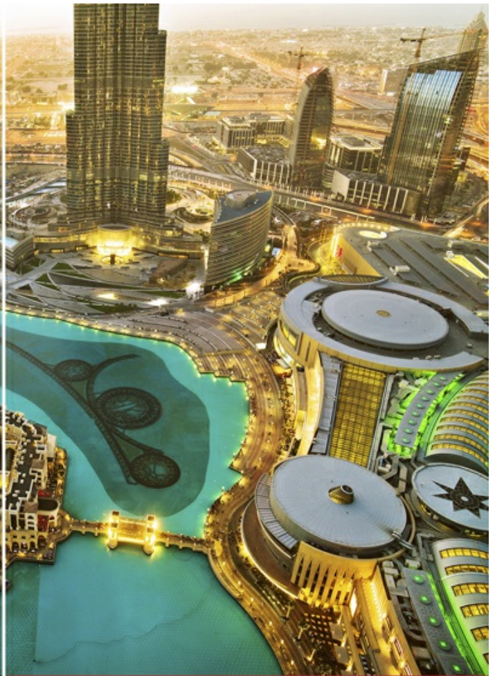
Ultra 4K HD