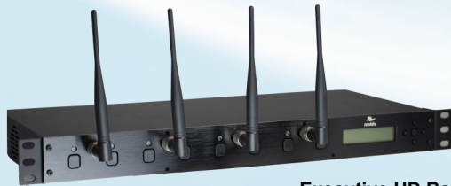
Executive HD Base Station