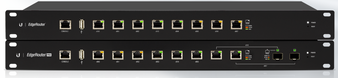
ER-8 (Top), ERPro-8 (Bottom)