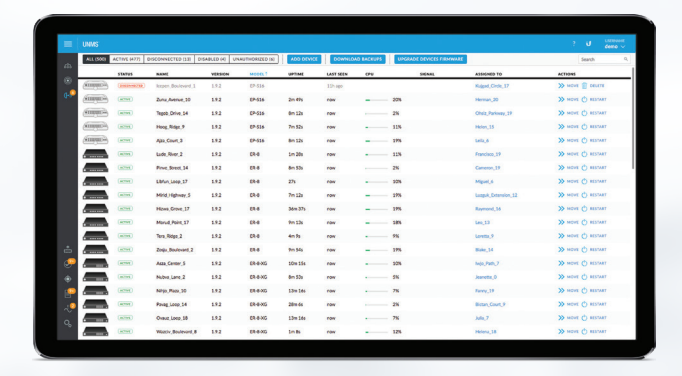
Use UNMS to register and manage multiple EdgeMAX devices