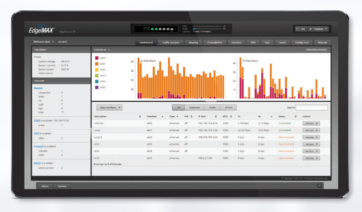
The Dashboard screen displays detailed statistics: IP information, MTU, transmit and receive speeds, and status for each interface.