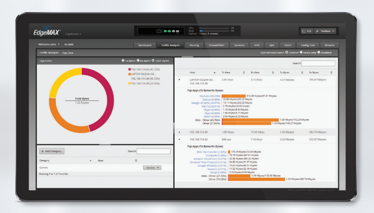
The Traffic Analysis screen displays status information about the traffic traveling through the EdgeRouter, including the local hosts and types of network traffic.