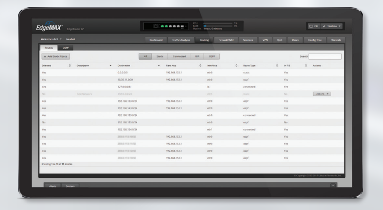
The Routing > Routes screen displays static, connected, RIP, and/or OSFP routes. You can add static routes on this screen.