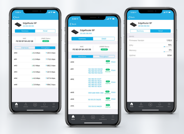
UNMS app to manage EdgeRouter using a mobile device