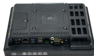
Multiple I/O ports, VESA mount, fanless design