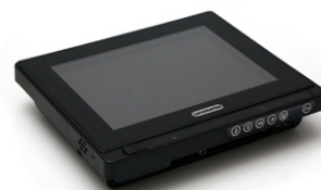
Compact design, single glass touch surface