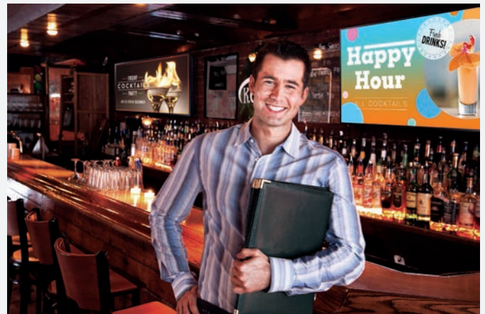
Figure 3. DBE Series engages viewers with stunning picture quality

DBE Series display deliver industry-leading performance and proven Samsung technology at an affordable cost. Featuring 350 nit brightness, and stunning picture quality with FHD resolution, these advanced displays that have been updated from the previous DBD Series, enthrall and engage viewers while offering reliable 16hours/7days operation. Additional features such as 2% haze along with enhancers for color, contrast and detail as well as color temperature control ensure optimized picture quality in various conditions enabling businesses to provide ideal messaging for maximum impact. Plus, the DBE Series energy-efficient design and power-saving features enable display operation with minimal power consumption and reduced heat emission compared to the previous DBD Series, so the displays are more energy-efficient and cost-efficient for business use.