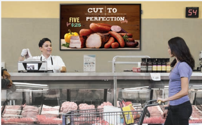
Figure 2. DBE Series enables instant message update and delivery

Samsung DBE Series SMART Signage provides high performance and cost-efficiency in a sleek and professional design. The displays' 350-nit brightness, reliable 16hours/7days operation and full-high definition (FHD) enable businesses to attract and engage audiences. A powerful quad-core processor and advanced, 3rd Generation Samsung SMART Signage Platform (SSSP) for embedded content management along with expanded 8GB storage capacity has replaced the previous 2nd Generation SSSP with Dual Core processor and 4GB memory storage to ensure robust business performance. DBE Series displays are easy to operate, install and maintain while consuming less power for economical use compared to the previous DBD Series. A wide range of sizes, and optional touch capability provides businesses with the flexibility to create and deliver a truly unique message on small signage.