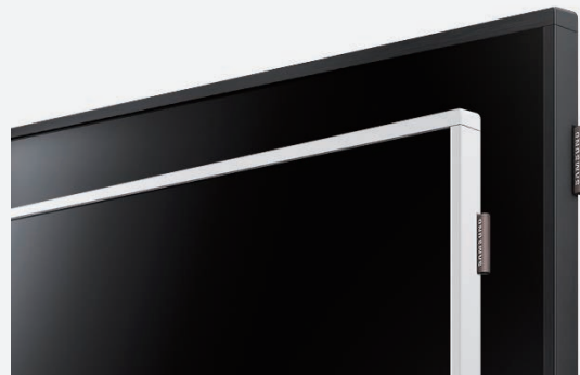
Figure 6. Various bezel options for polished and professional look

DBE Series Smart Signage enhance the display environment through their sleek, streamlined design, reflective of previous Samsung D Series SMART Signage for efficient compatibility. These stunning displays feature optional black hairline or white color slim deco-bezels to compliment the specific room decor. And, a flexible, tag-type spacer with a logo is designed for either portrait or landscape installations to create a polished, professional look in any space.