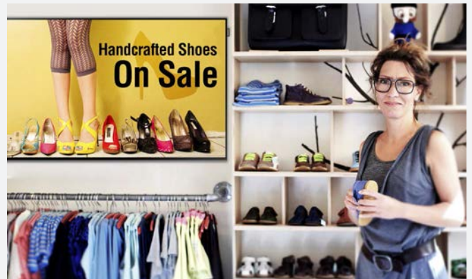
Figure 1. Samsung DBE Series SMART Signage elevates store decor while delivering messages effectively

Today's retail stores and corporations are leveraging innovative digital displays to communicate with customers and present business information. Digital signage is an effective way for retailers to promote products, unify brand identity and increase traffic. Businesses now commonly use digital signage as a replacement for cumbersome conventional projectors to dynamically connect with clients, staff and visitors. When seeking digital signage solutions, today's companies look for displays that are versatile and cost-efficient, as well as easy to connect, install and control.