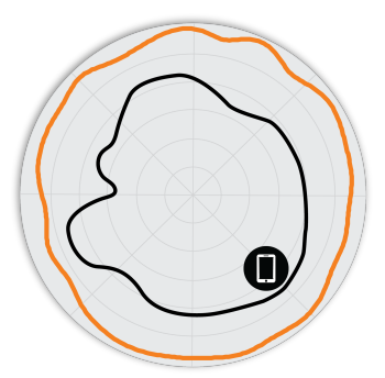
Figure 3. R650 5GHz Azimuth Antenna Patterns