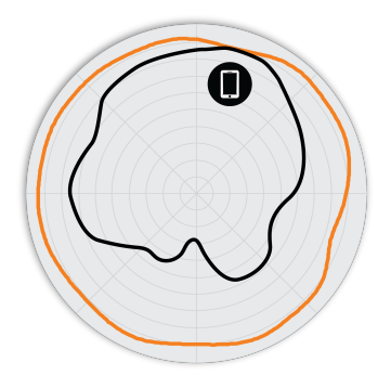
Figure 2. R650 2.4GHz Azimuth Antenna Patterns