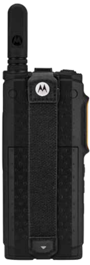
PMLN7076 Flexible Hand Strap