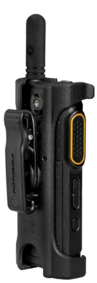
PMLN7190 Carry Holder/Holster with Swivel Belt Clip

By spending countless hours in the field with customers, we've developed accessories that aren't just the most innovative. But also the most useful.