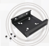
ThinkCentre Tiny VESA Mount II