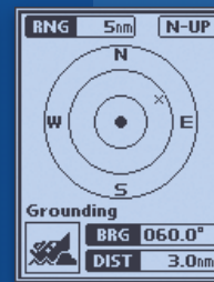
Pop-up window for position check