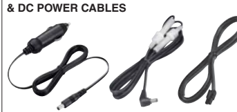
CP-25H OPC-515L OPC-656 For use with For use with For use with BC-210 BC-210 BC-197