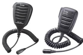
HM-167 HM-202 IPX8 rugged type IPX7 compact type