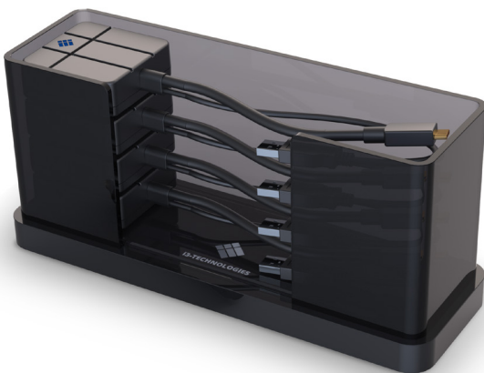
i3ALLSYNC Storage (optional accessory)