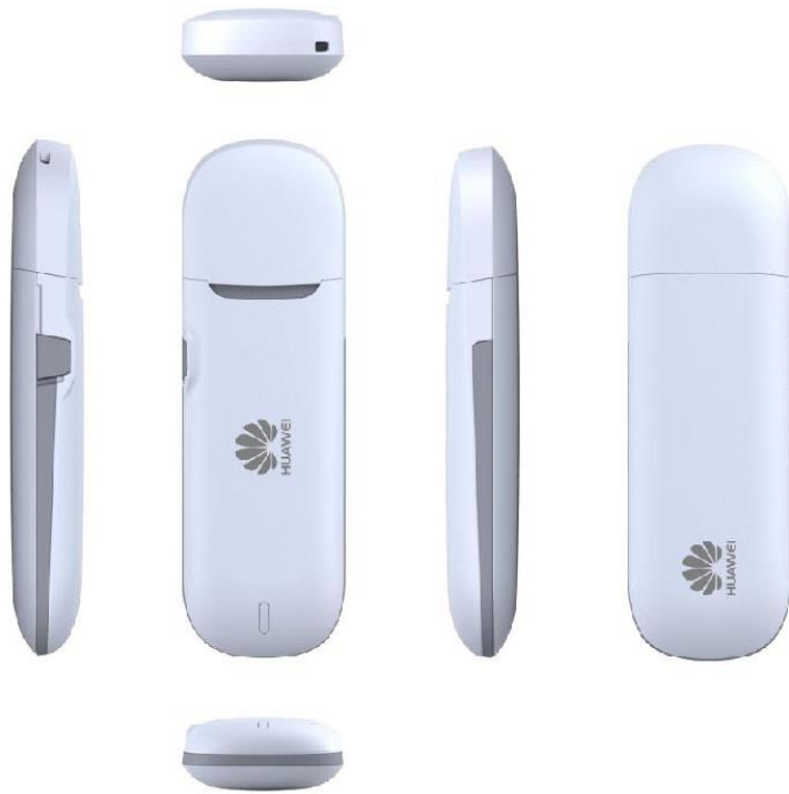
Figure 1-1 HiLink E3131 profile