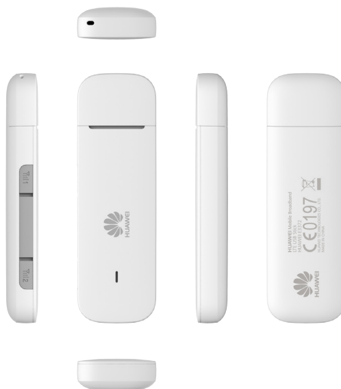
Figure 1-1 E3372 profile

Figure 1-1 shows the profile of the E3372.