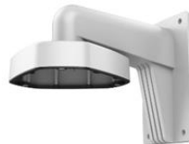
DS-1273ZJ-DM25 Wall Mount