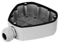
DS-1280ZJ-DM25 Junction Box