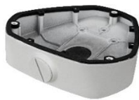
DS-1281ZJ-DM25 Inclined Ceiling Mount