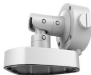
DS-1283ZJ Wall Mount (3-axis Adjustment)