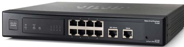
Figure 1. Cisco RV082 Dual WAN VPN Router

To further safeguard your network and data, the Cisco RV082 includes business-class security features and optional cloud-based web filtering. Configuration is a snap, using an intuitive, browser-based device manager and setup wizards.