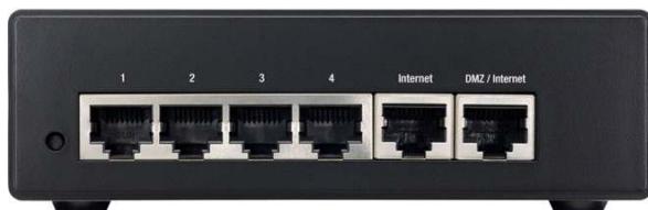
Figure 2. Back Panel of the Cisco RV042G

Figure 2 shows the back panel of the Cisco RV042G. Figure 3 shows a typical configuration.