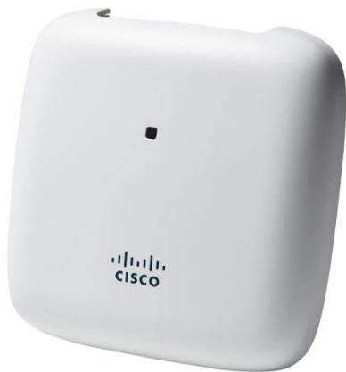
Figure 1. Cisco Aironet 1815m

With the increased coverage area, 802.11ac Wave 2 support, and the functions and features of an enterprise-level access point, the 1815m fully meets the growing requirements of wireless networks by delivering a better user experience (Figure 1).