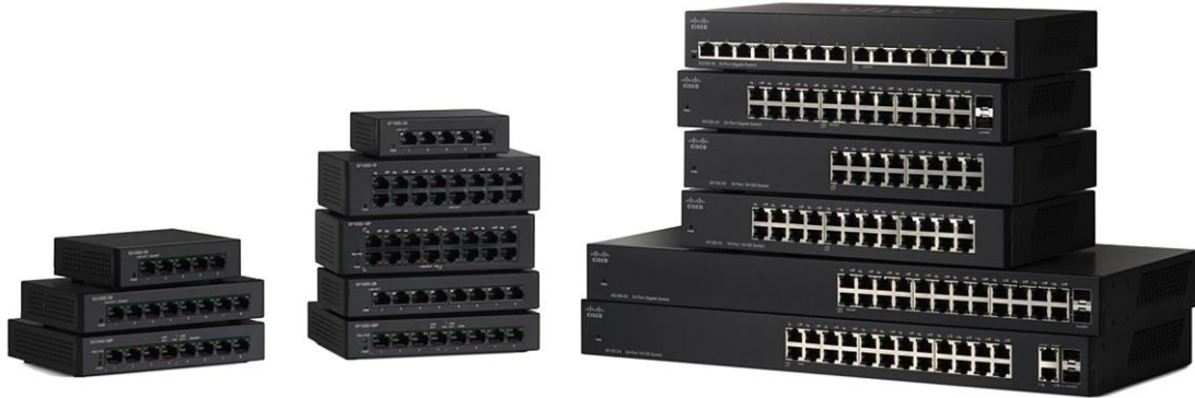
Figure 1. Cisco 110 Series Unmanaged Switches