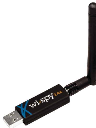
Wi-Spy 2.4x 2.4 GHz