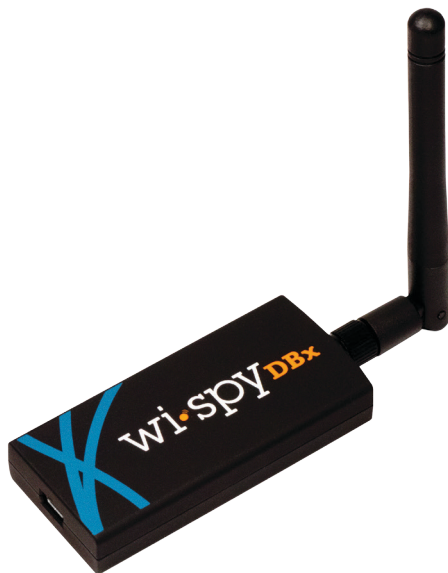
Wi-Spy DBx 2.4 & 5 GHz