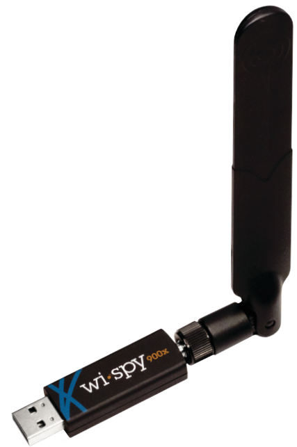
Wi-Spy 900x 900 MHz