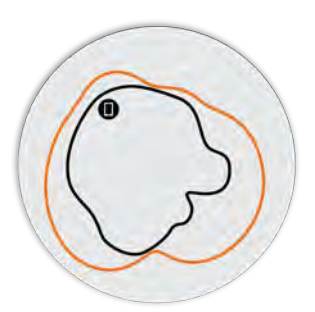
Figure 2. R350 2.4GHz Azimuth Antenna Patterns