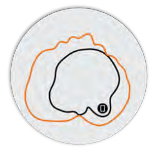
Figure 3. R350 5GHz AzimuthAntenna Patterns