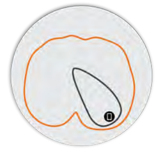
Figure 4. R350 2.4GHz Elevation Antenna Patterns