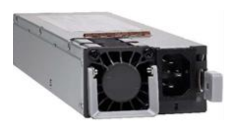
Figure 15. 1600W AC power supply

Tables 9 and 10 provides more details on the Cisco Catalyst 9500X models power supplies